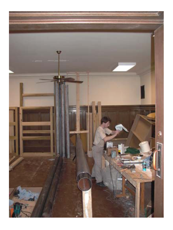
Figure 29. On-Site Pipe Making (16' Praestant)

wooden tracker links were threaded through the instrument linking the keyboards with the windchests, and the mechanical system linking the ninety stop controls with windchest sliders and keyboard couplers was put together.