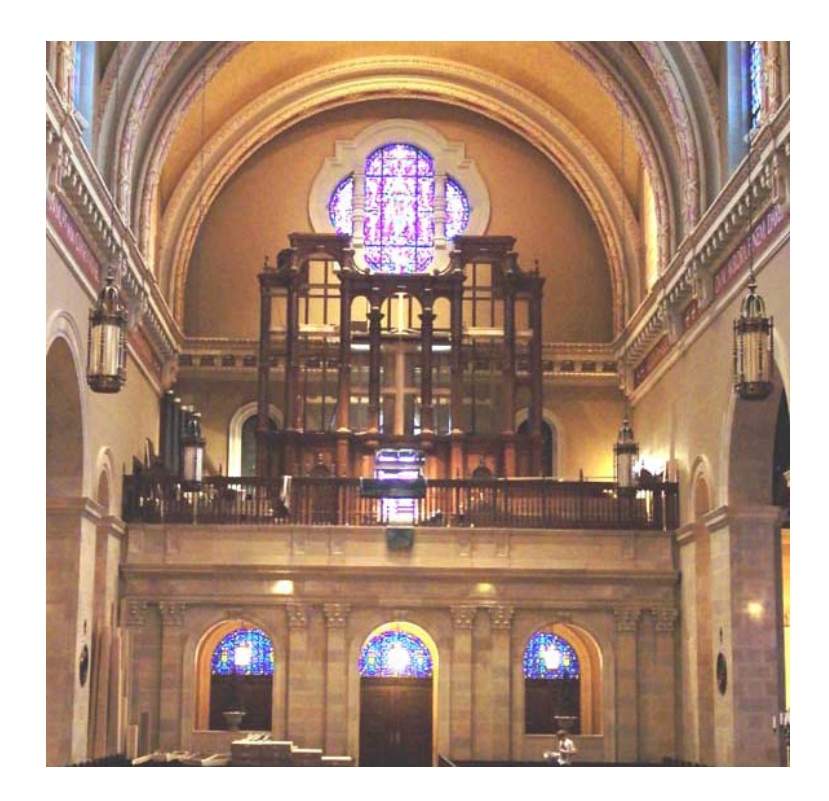
Figure 28. Case Assembly

Pipe maker Markus Hahn also had to make the largest metal pipe resonators on site since they were too large to safely transport (Figure 29). So too were the wooden resonators of the 32' Trombone assembled at the time of their mounting and anchoring to the west wall of the cathedral.