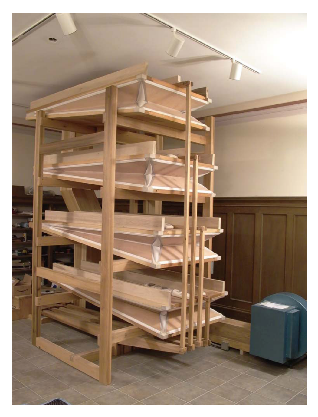
Figure 30. Bellows